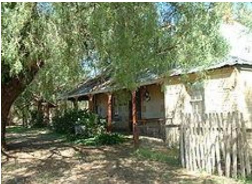
Royal Mail Hotel built in 1847