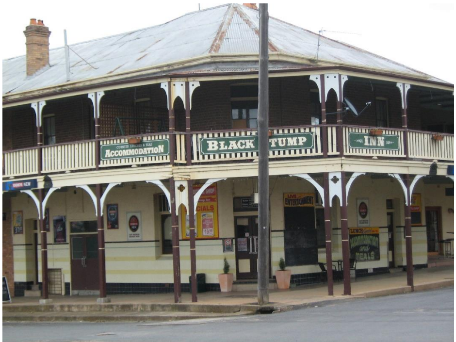
The Black Stump Inn

McMaster Park, at the corner of Binnia and Booyamurra Streets, is an appropriate place to pause and have a picnic. It is the heart of the town and has a pleasant garden, a tourist guide map, barbecues, play facilities and a 19th century bullock wagon. There is also a pine tree grown from a seed sent from Lone Pine by a soldier from Coolah who fought at Gallipoli.