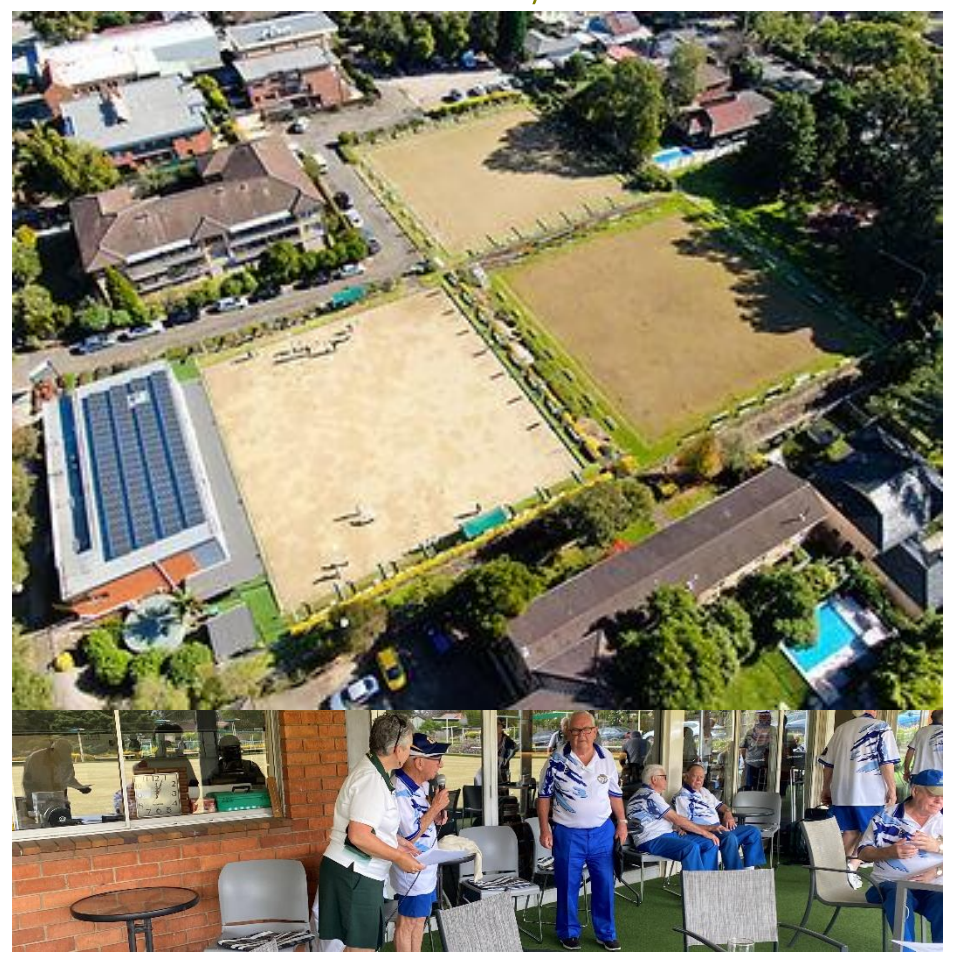
Page 1 of 25