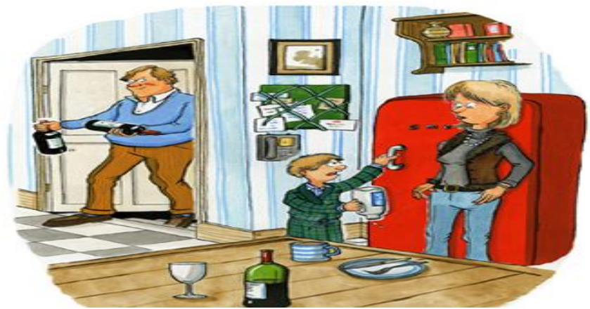
"Why do we always run out of milk? Daddy never runs out of wine."