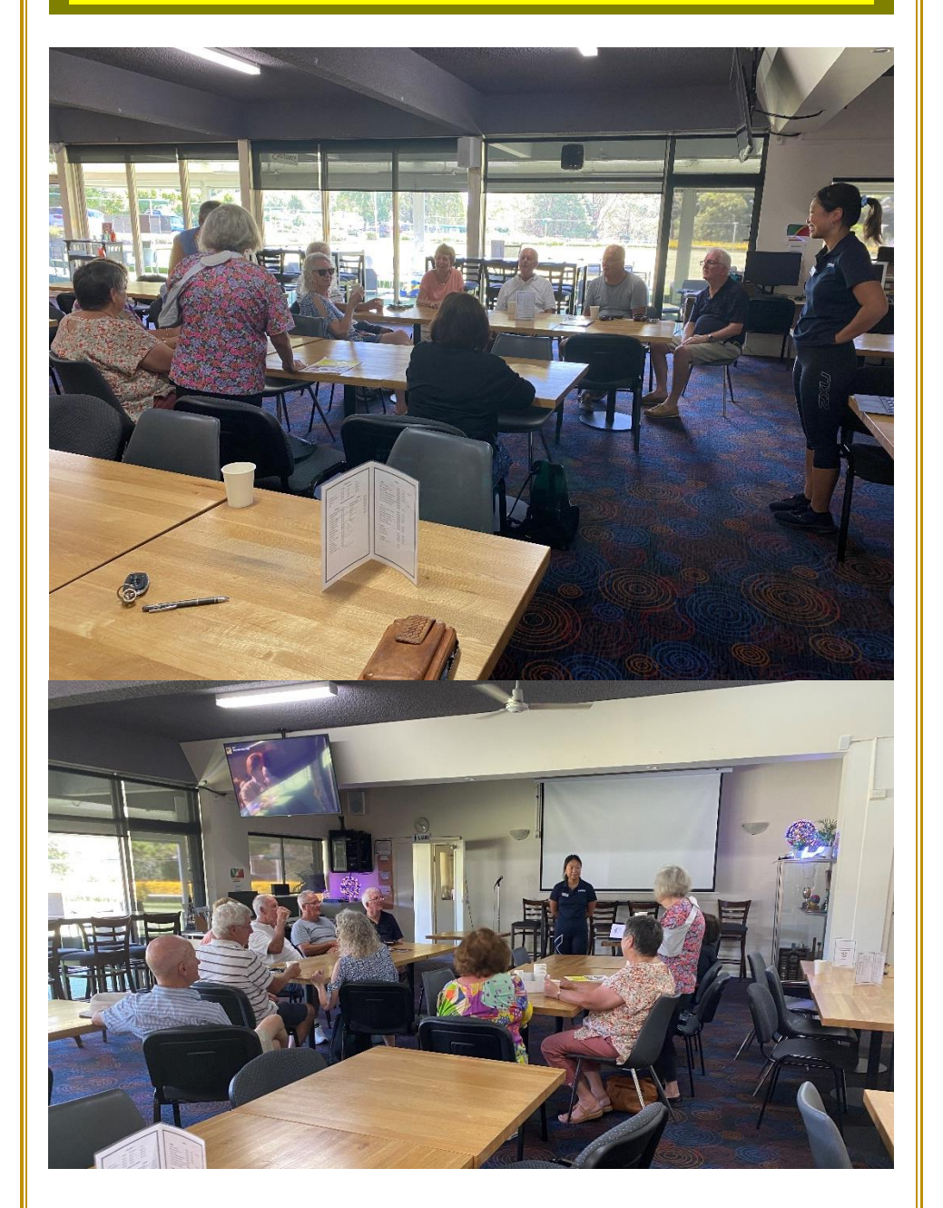
Page 20 of 25