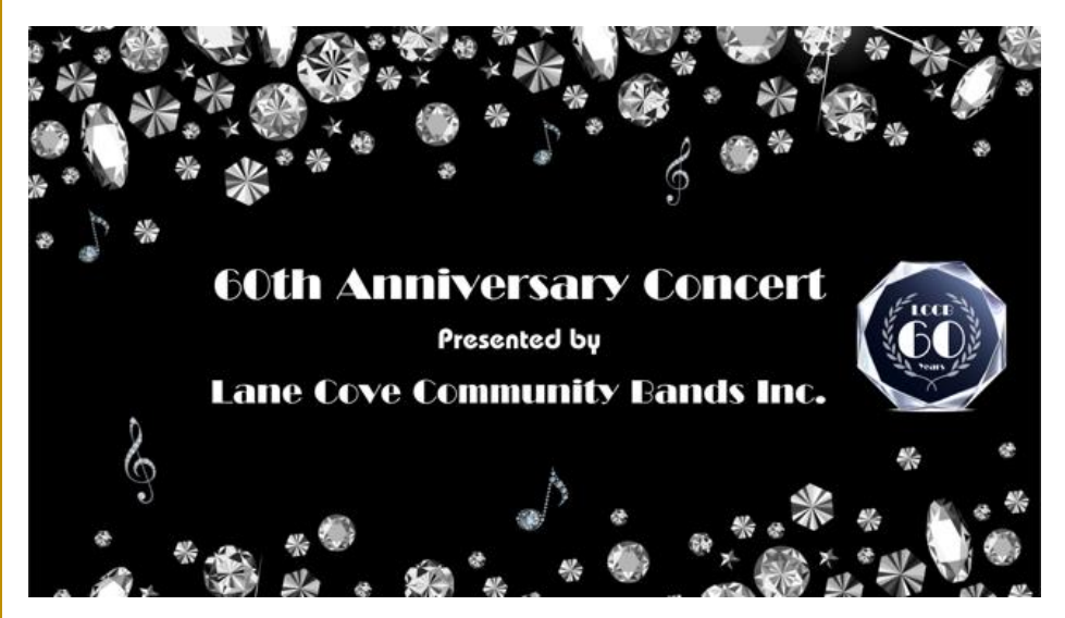
The Concourse Concert Hall CHATSWOOD