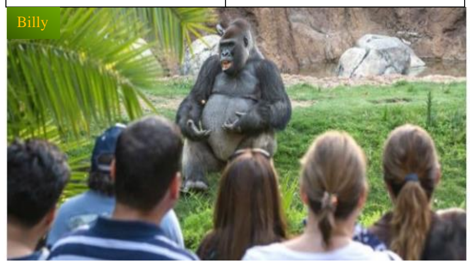
"Humans. A virgin birth I can believe, but finding three wise men is something else?"