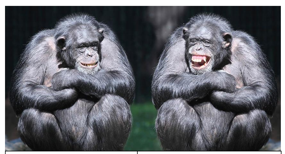
Jangles, what if you don't succeed at first?