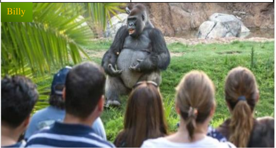
Yes Spike. But the problem is you can't tell them apart these days!

"Humans. Why do you call it "quick sand" if you sink in it slowly." WORD OF THE