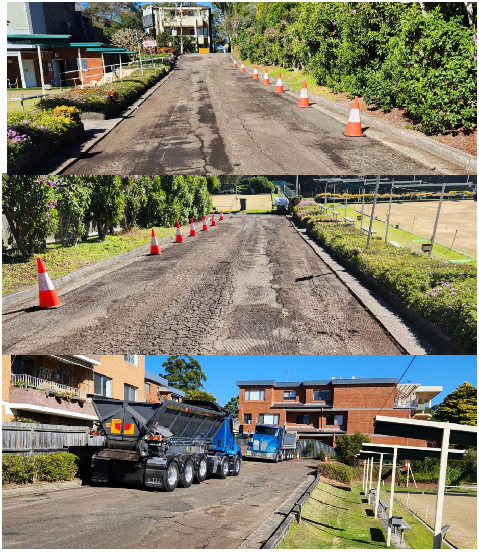
Page 9 of 24

Last week the Lane Cove Council milled and laid a new asphalt pavement, including reinstating line marking, to the roadway bounding the Club and greens through Charlish Lane. This is a great improvement for the Club enhancing member and public safety and convenience.