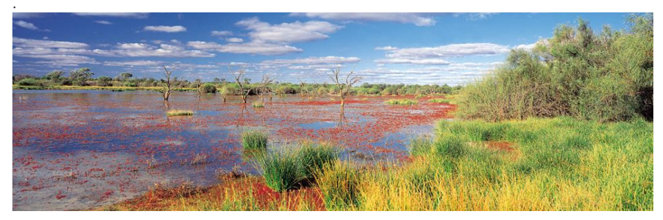
Page 15 of 24

* In 2016 the town had a population of 270.