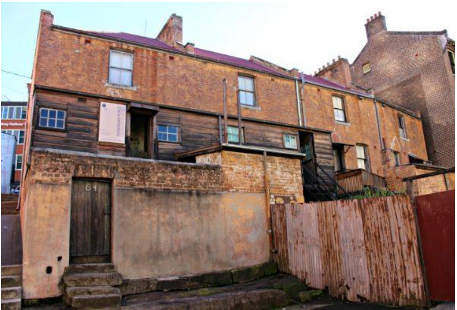
Susannah Place rear door

While most of Sydney's historic buildings have been stately or luxurious, Susannah Place was once home to Sydney's less prosperous residents. Sitting in the historic Rocks district on Sydney Harbour, Susannah Place was a row of terraces built in 1844 by Irish immigrants and occupied by a wide array of working-class Sydneysiders right up until its conversion to a museum in the 1990s.