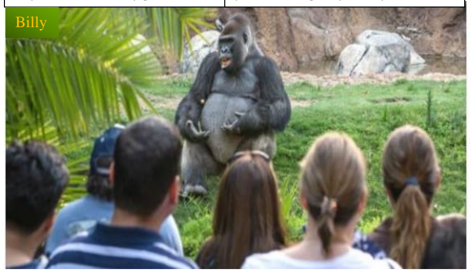
"Humans, I can win an argument on any topic, against any opponent. You know this, and steer clear of me at parties. Often, as a sign of your great respect, you don't even invite me."