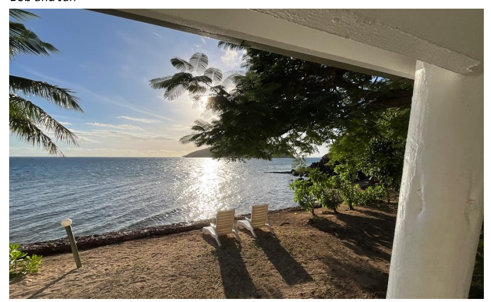
Bure is the Fijian word for a wood-and-straw hut, sometimes similar to a cabin.