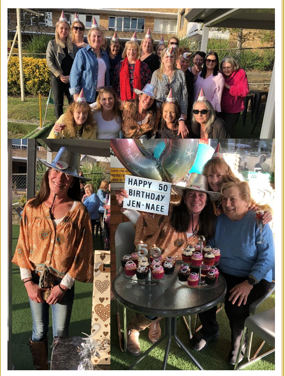
Page 12 of 28