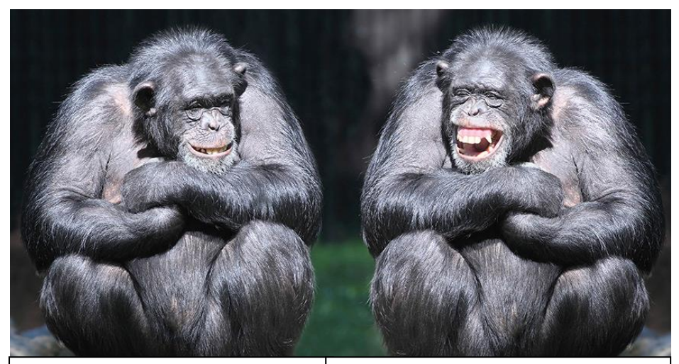
Spike, when I die will you promise to pour a beer on my grave?