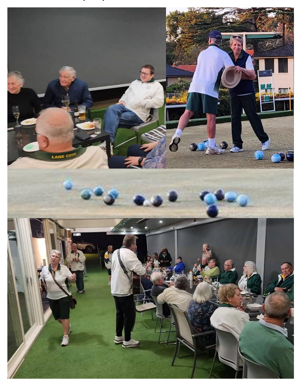
Page 13 of 24