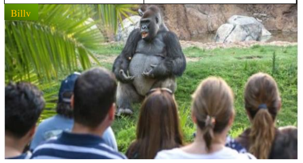
"Humans do you know you should never stand between a dog and a fire hydrant."