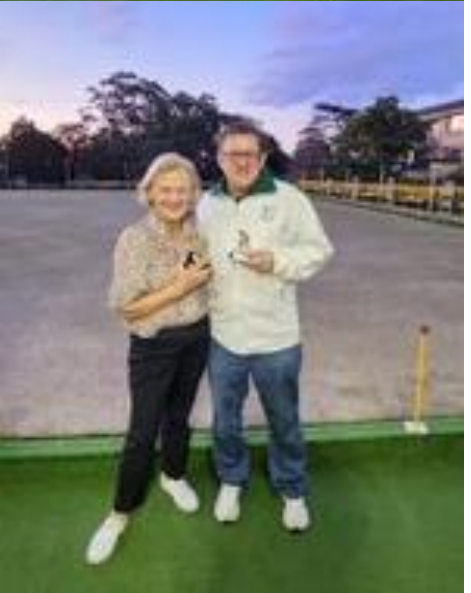
Page 11 of 24