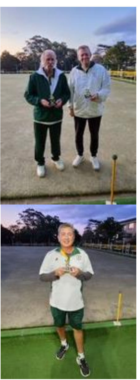
Page 10 of 24