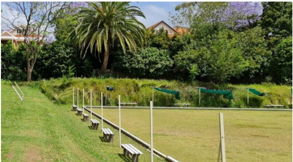
East Roseville BC

Since this story was finalised by our Journalist, Ku-ring-gai Council has discussed this item at the 15 February 2022 Council Meeting. and voted to proceed with the sale of the Roseville site.