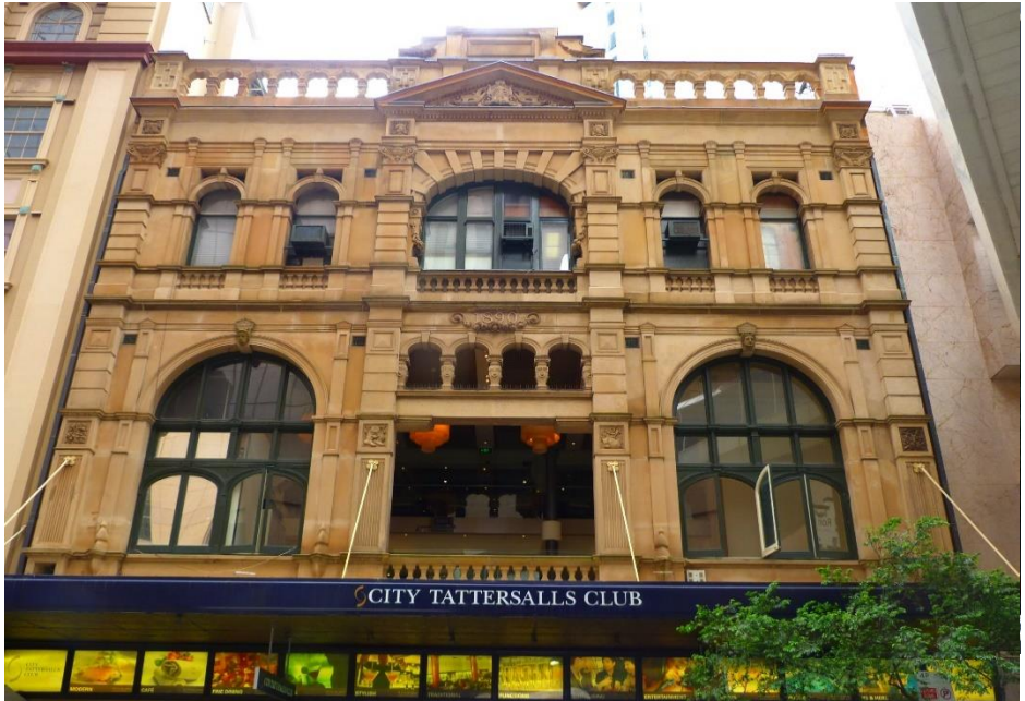
The heritage-listed Pitt Street clubhouse is currently undergoing major redevelopment.