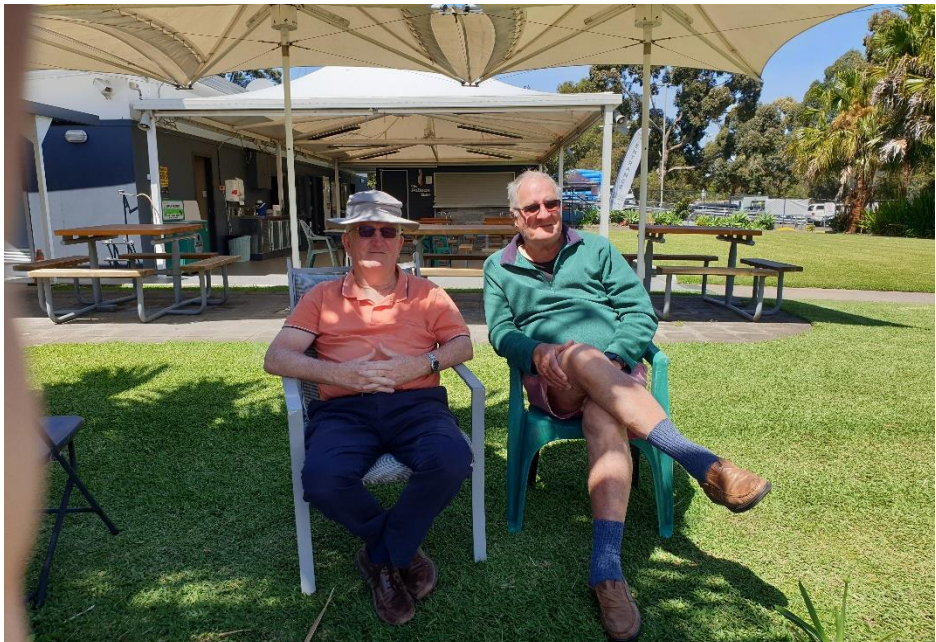
Not a care in the world! Eyeing the talent at Pittwater on Sunday.