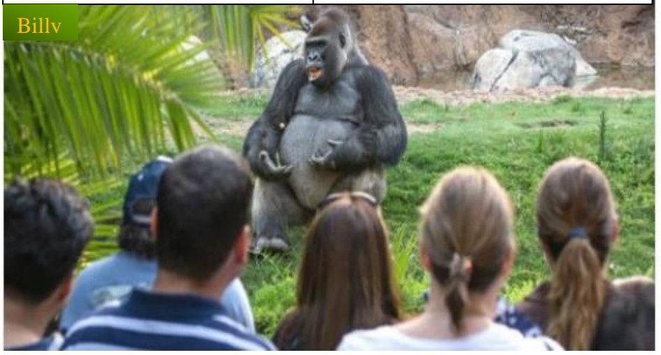
Spike, I'd suggest that they wear a tail!

"Humans. Always remember, a cat looks down on man, a dog looks up to man, but a pig will look man right in the eye and see his equal."