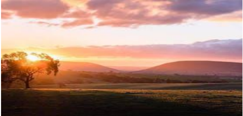
Page 11 of 20

^{\ast} In 1879 a blacksmith's shop was opened in the town and the local police station was built the following year