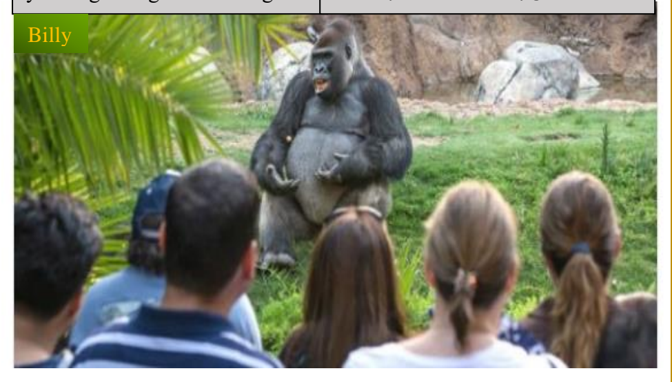
"You know humans the wisdom of old men in a great fallacy. They do not grow wise. They grow careful."