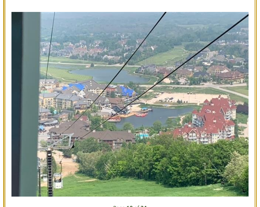
Page 10 of 24

The view from the top was spectacular spreading out miles along the Georgian Bay.