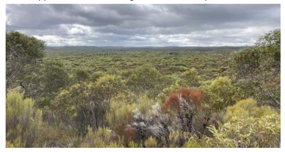
Page 17 of 24