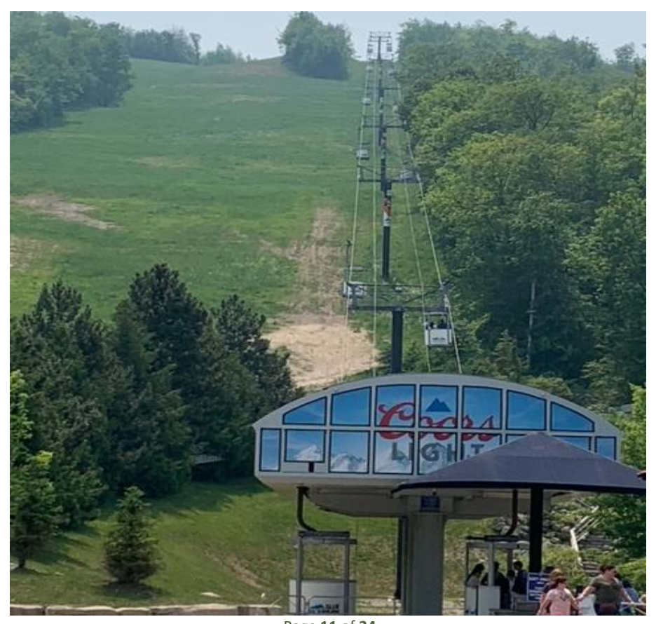
Page 11 of 24

Limestone makes up the bottom too, giving the water an almost tropical, turquoise hue.