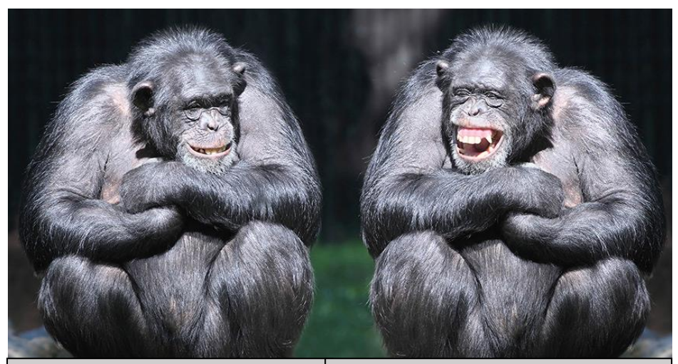
Spike, if your palm itches you're gonna get something.