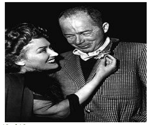
Page 13 of 16