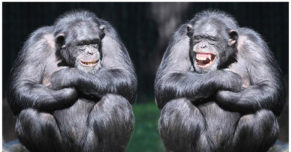
Jangles. If laughter is the best medicine, your face must be curing the world.