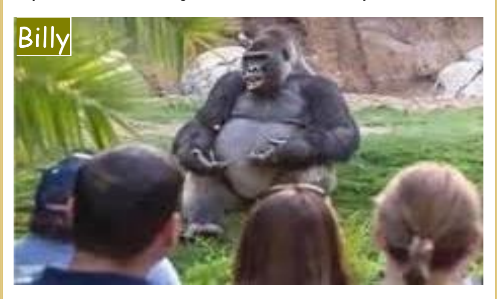
People. Now listen to me! You are proof that evolution can go in reverse.