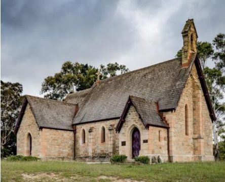
Christ Church Anglican Church