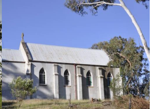
St Michael's Roman Catholic Church