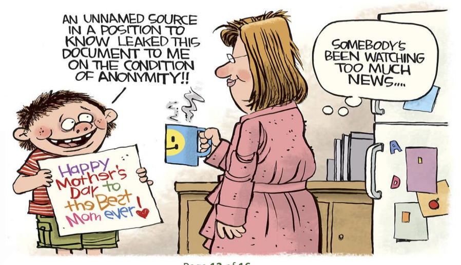
Page 13 of 16