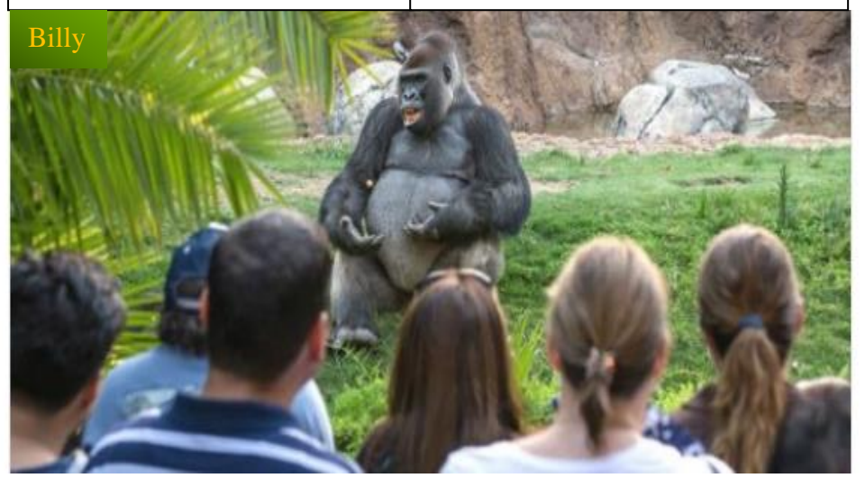
Yes Spike, I do. I yelled "I know the entire alphabet" and we all laughed and laughed except one guy.

"Humans. Do you know wise men speak because they have something to say; Fools because they have to say something."