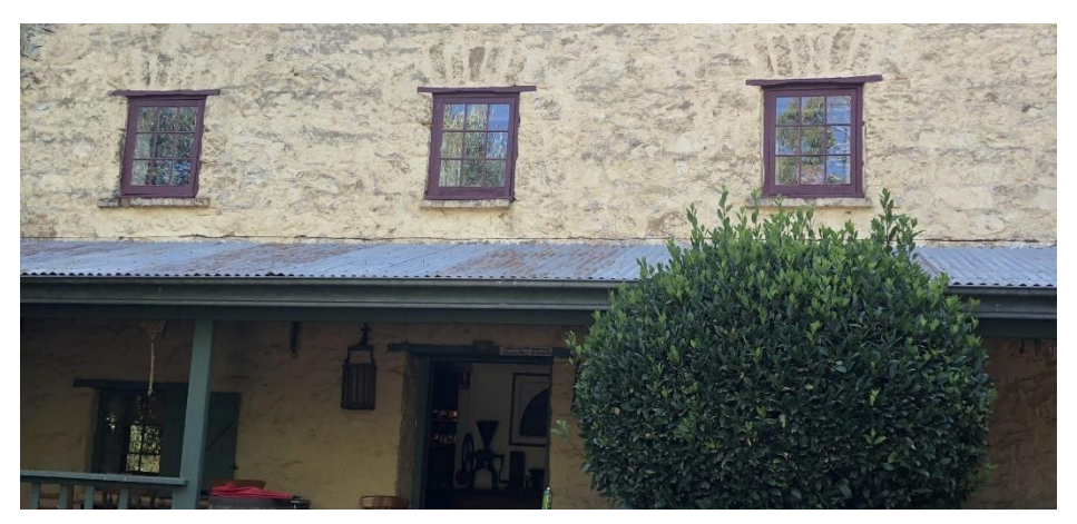
Page 13 of 24

Laggan, named by Governor Macquarie, lies 9 km north-east of Crookwell. It is surrounded by rolling hills given over to farming and grazing. The old Willowvale Mill, built in the 1850s, closed in 1904, restored in the 1970s and opened as Willowvale Mill restaurant is now a guesthouse and restaurant which is highly rated as the best restaurant in the district.