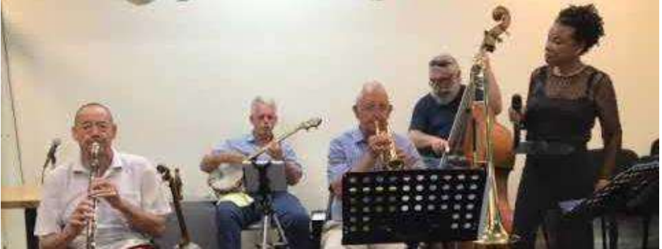
Delta Jazz will return in the New Year – Watch this Space